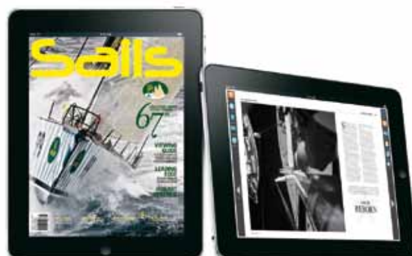
REALVIEW Digital editions