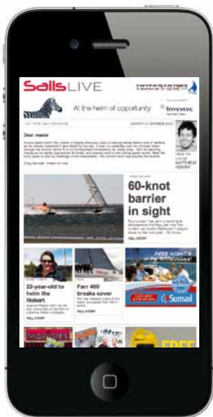
SAILS LIVE Email newsletter

Sails online. Our website www.sailsmagazine.com.au provides a true cross-media platform for readers and advertisers to access Sails online. This includes Sails Live news with our Top 5 news stories of each week. Plus we publish the Top 5 features from the current issue on our website free of charge. E-newsletters are sent weekly alerting our readers about the latest content and breaking news.