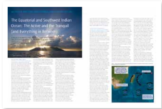
WEATHER ROUTING For a mariner it is of vital importance to be knowledgeable about the weather to expect en route. When your scope spans oceans and many seas in between, its time to consult the experts. Weather Routing Inc. have compiled a valuable historical guide to weather patterns along every step of The Great Southern Route .