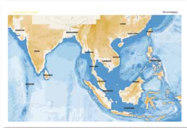
REGIONAL OCEAN CHARTS AND CHARTLETS Expansive charts of oceans and regions are provided to provide better insight into "the big picture" of the regions you will cruise. Compiled by blending the comprehensive electronic charts of Jeppesen Marine to form an overlay of entire regions. Electronic cartography allows you to zoom in on the world for specific points of interest in many countries or regions visited.

Content. The extensive and reliable information available through the pages of GSR is thoroughly researched, providing key contacts with superyacht experience in every listed destination, spanning two-thirds of the globe. The firsthand advice, captain to captain, on what to expect when contemplating a cruise to some of the most isolated destinations on Earth plus the inclusion of charts and weather advice is invaluable.